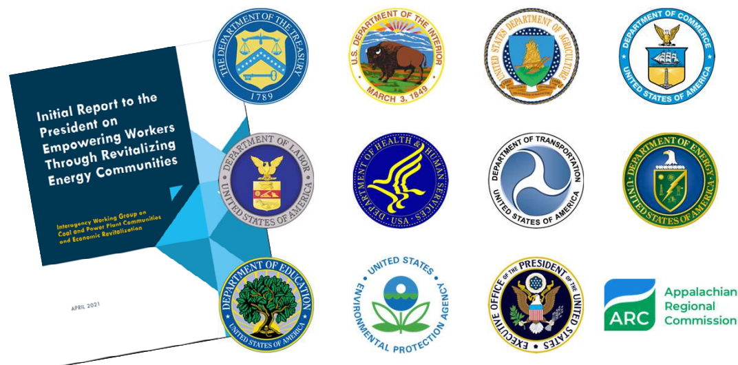
Initial Report to the President on Empowering Workers Through Revitalizing Energy Communities, Released April 23, 2021