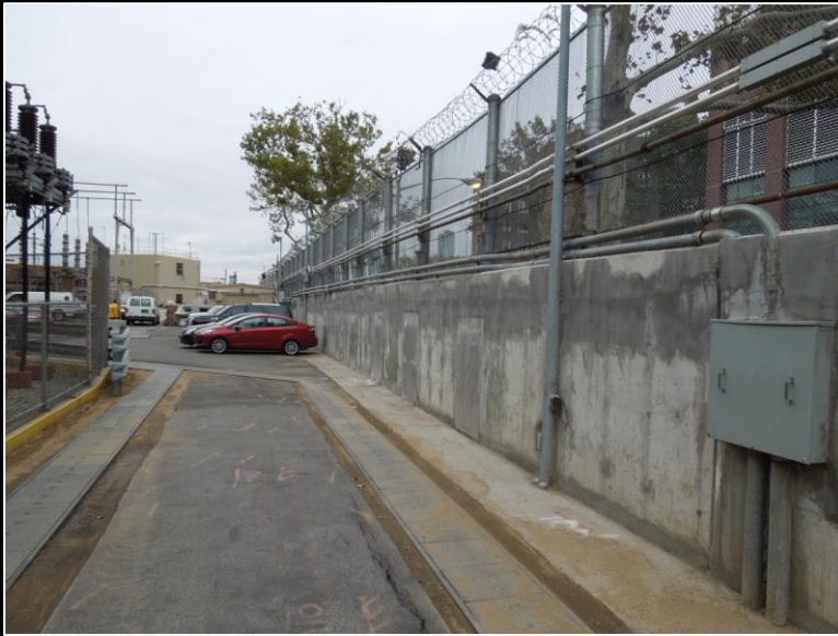
Reinforced Perimeter Flood Wall

Storm Hardening – Perimeter Walls & Elevated Equipment