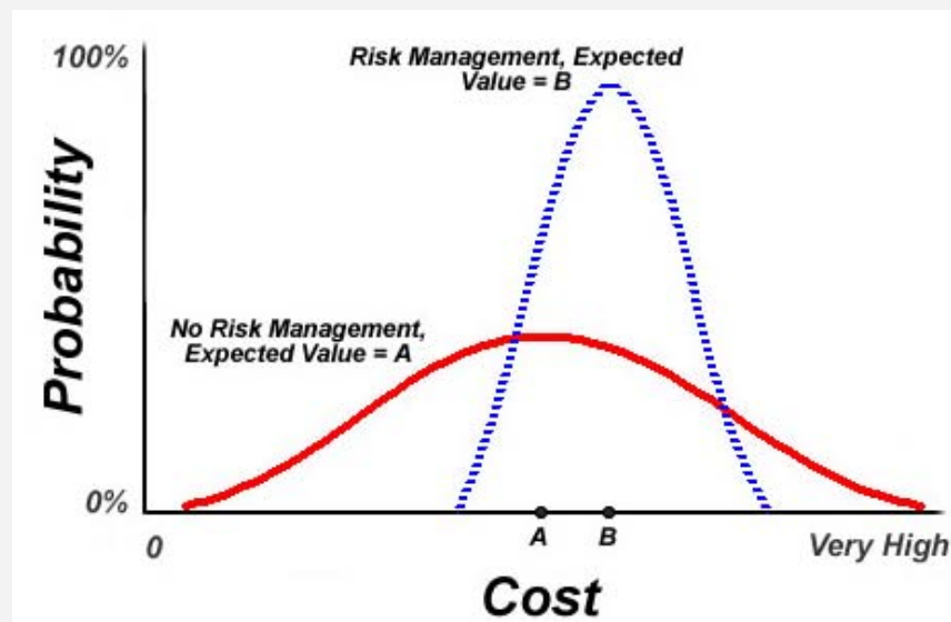
Figure 3.1. One view of the possible impact of hedging on risk exposure for the cost of a portfolio of resources.

Curve B is much narrower, illustrating the reduction in uncertainty about portfolio cost, but is shifted to the right, reflecting the extra fixed cost of some of the risk mitigation measures. So, comparing these hypothetical probability distributions, we would have to make what may, or may not, be a difficult decision, i.e., is it worth paying a somewhat higher expected cost to avoid exposure to the possibility of a very high cost. If the differences in costs under the two approaches are minimal the decision may not be difficult. If the differences in costs are large, the decision becomes more difficult. Or, we might decide to look harder for cost effective ways to reduce risk, such as adding less volatile renewable generators or ramping up energy efficiency to reduce the need for market purchases.