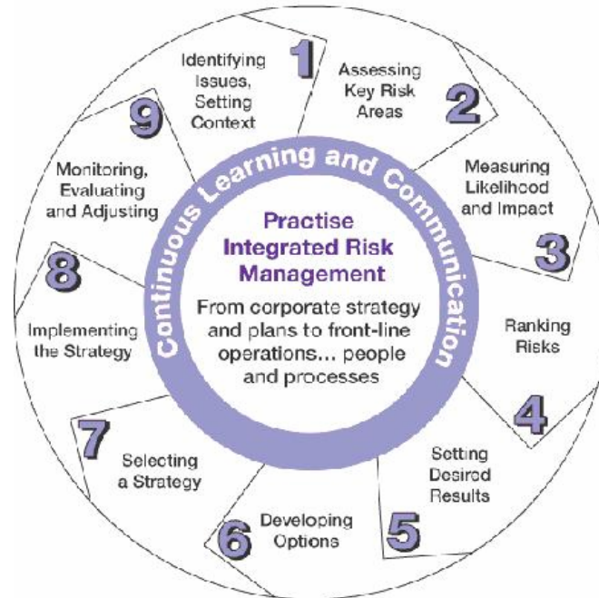
Figure 5.1. The role of the regulator in risk management is dynamic in nature. 24