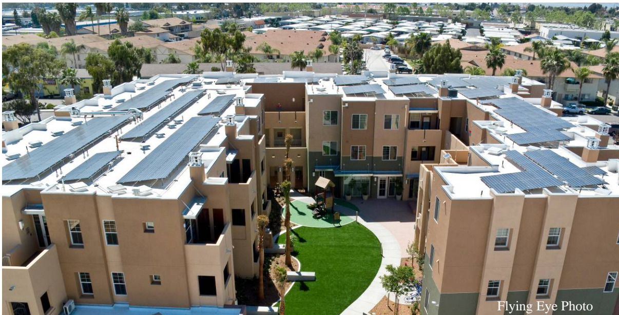
Flying Eye Photo